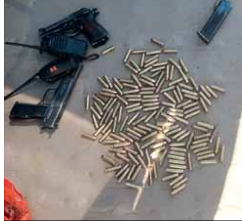
Top: High calibre ammunition and unlawful firearms were confiscated by the police during intensified "Operation Kakula" in Sekhukhune District.

hand radios, shotgun carbine type rifle, 16 ammunition of Z88 firearm, CZ 75 firearm, one Norinco firearm and Berreta firearm. "Some of the arrested suspects have already appeared at their respective magistrate's court for various offences," he said. Commissioner Lieutenant General Hadebe has once more, warned the public that operation "KUKULA" and other operations will continue to get rid of all criminals. Hadebe had also assured that the police will continue to ensure the safety of communities across the province.